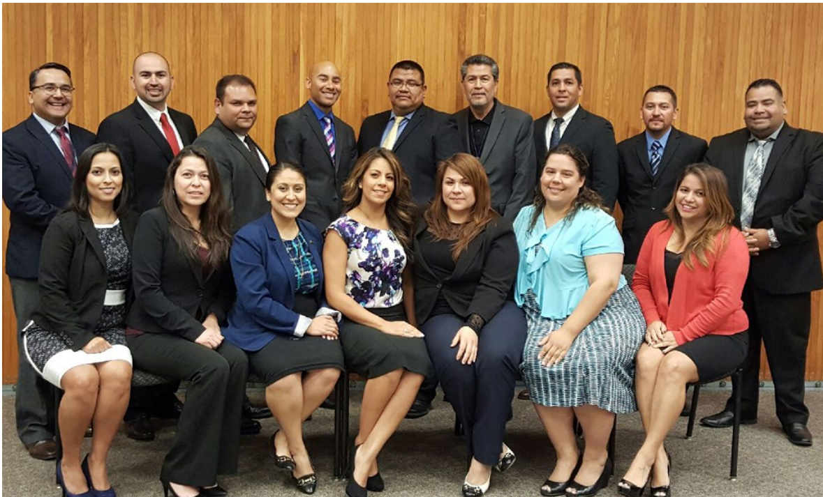
2015 SF HAAC Executive Council