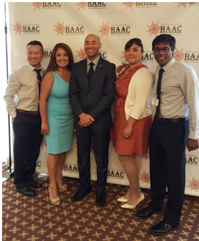
Santa Barbara District Staff